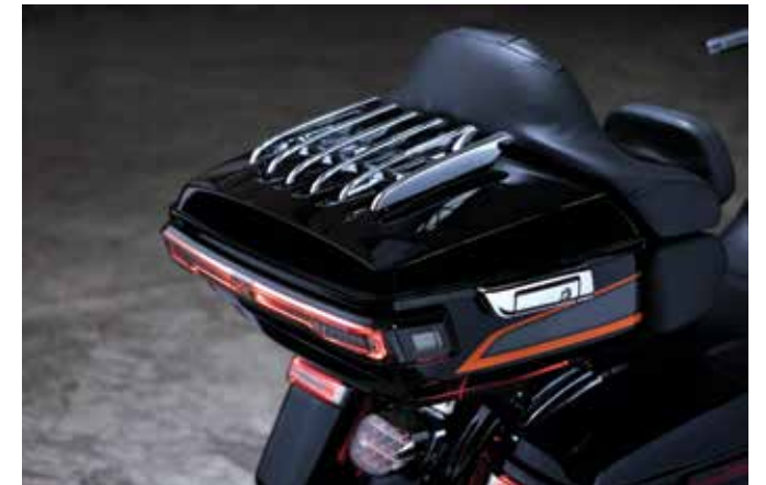
STEALTH TOUR-PAK LUGGAGE RACK 53000242

Step up to the ultimate motorcycle audio experience. These speakers deliver ultra-clear highs, super clean mids, and ground thumping bass. These amplified three-way speakers feature a durable injection molded woofer and a separate bridge-mounted Midrange and Tweeter speakers.