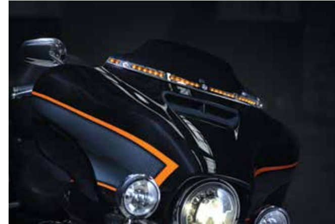
ILLUMINATED WINDSHIELD TRIM 57000394A

MAKE IT YOURS. THIS FULLY-LOADED TOURING BIKE TRULY DOES HAVE IT ALL, NOW WITH THE EXCLUSIVE APEX PAINT OPTION.