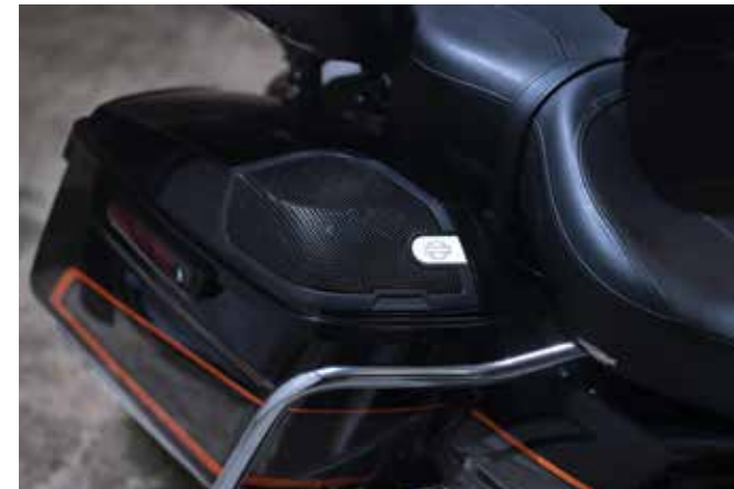
HARLEY-DAVIDSON AUDIO POWERED BY ROCKFORD FOSGATE - STAGE II SADDLEBAG SPEAKERS 76000987

The Ride Free collection celebrates our liberty to enjoy the freedom of the open road, and calls us all to explore, discover and unite with our love of motorcycling. Inspired by Willie G Davidson's famous phrase, this collection continues that tradition.