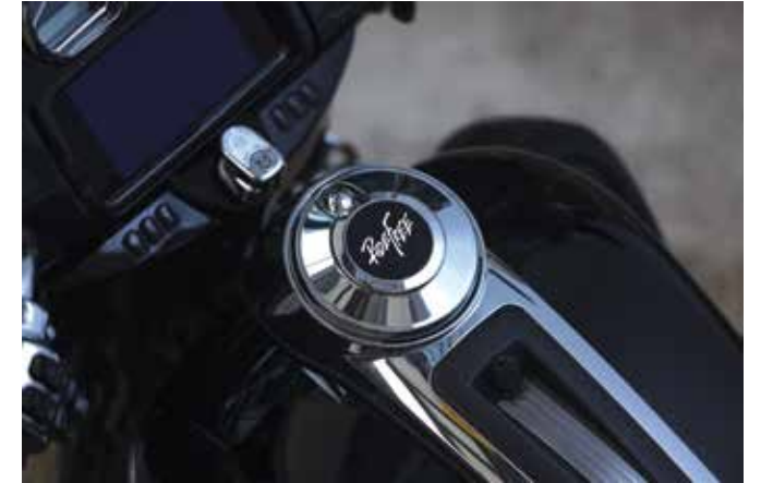
RIDE FREE FUEL TANK CONSOLE DOOR 70900843

Smoked lenses hide bands amber LED lamps that glow as running lamps when the ignition is on, and the two outer clusters function as auxiliary directional indicators when the turn signals are activated.